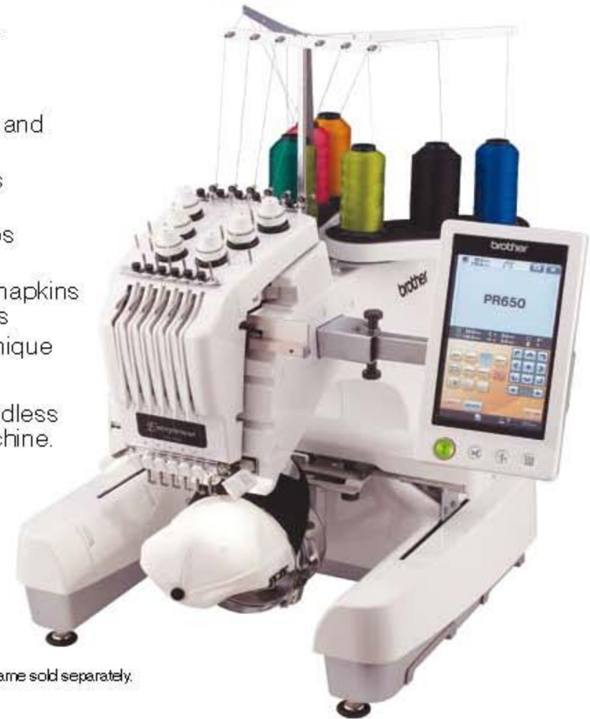
Cap frame sold separately.

The business possibilities are endless with the PR-650 embroidery machine.