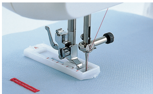
4 STEP AUTOMATIC BUTTONHOLE