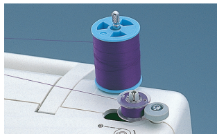
AUTOMATIC BOBBIN WINDER