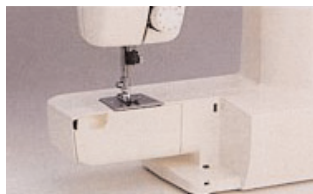
FREE ARM SEWING