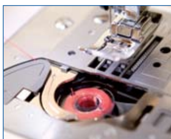
Quick set bobbin. Just drop in a full bobbin and you are ready to sew.

Fast sewing – Create with speed at up to 850 stitches per minute sewing speed.