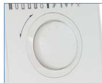
Electronic jog dial makes stitch selection quick and simple.