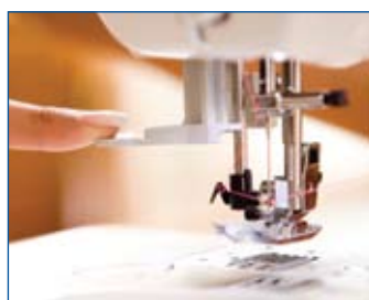
Easy Automatic needle threading