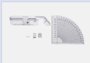
Circular attachment Create precise circles with a radius ranging from 30mm to 130mm. A great tool for creating circles with straight stitching, zigzag, embellishing and decorative stitches.

For more informations see your dealer or visit www.brothersewing.eu .