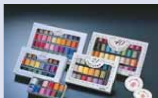
Embroidery threads Large collection of high quality embroidery threads