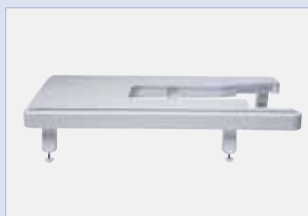
Wide table for easier handling of fabrics when sewing or working with quilting or large projects.