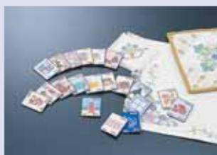
Embroidery card library Hundreds of fantastic patterns to choose from!