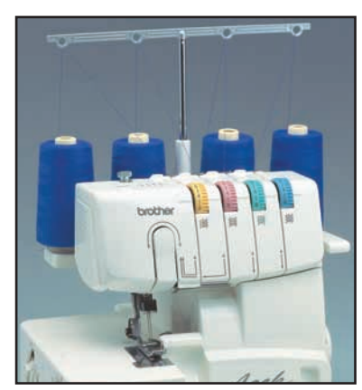
EASY TO FOLLOW LAY-IN THREADING